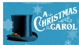
A Christmas Carol: